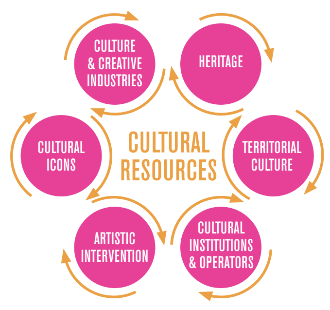
Figure 2 - Cultural resources in cities - Source: KEA (2013)

The cultural and creative resources are diverse: